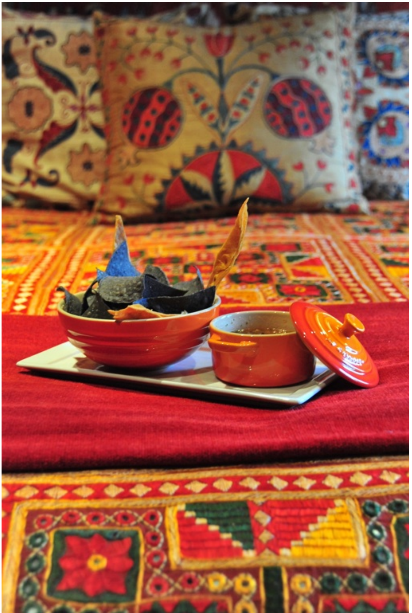
Original welcome @The Inn of the Five Graces