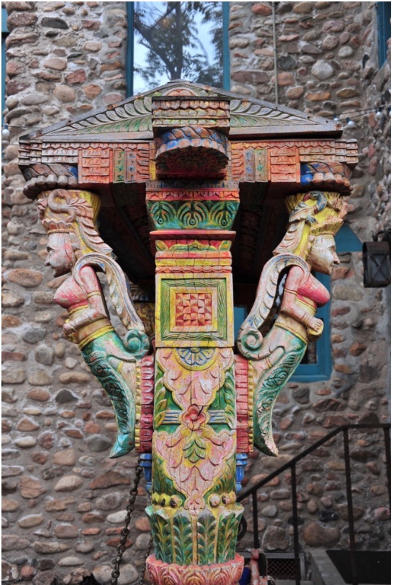
The Inn of The Five Graces mixes East Indian art with Tibetan art. Wowwatchers.com